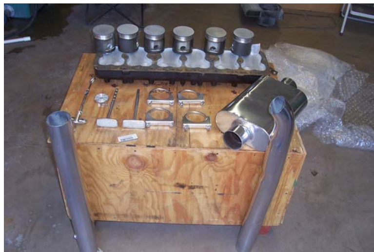
Some of the 21 Paige coated parts before assembly